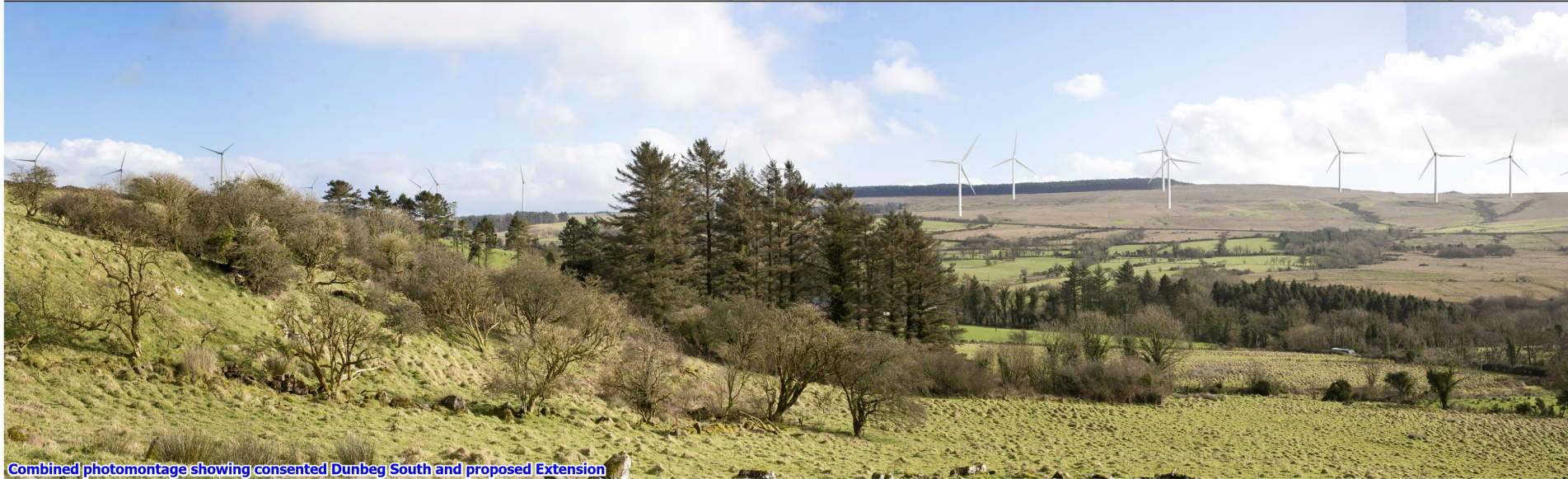
Combined photomontage showing consented Dunbeg South and proposed Extension

This material is based upon Ordnance Survey digital data © Crown Copyright 2024 and is reproduced with the permission of Land and Property Services under delegated authority from the Controller of Her Majesty's Stationery Office. All rights reserved. Licence No. 242.