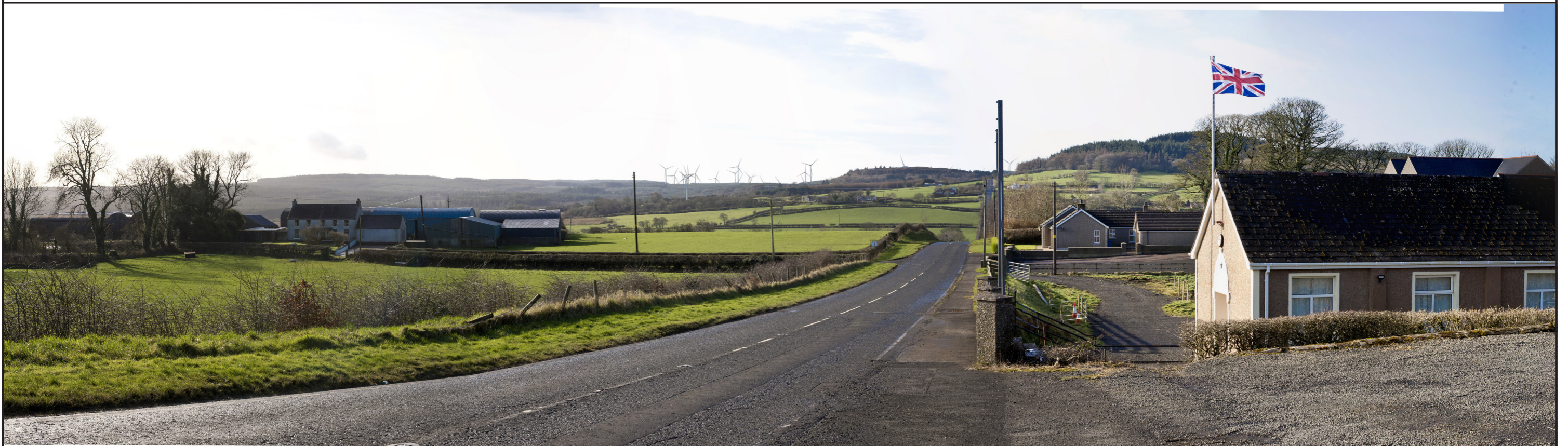
Combined photomontage showing consented Dunbeg South and proposed Extension

This material is based upon Ordnance Survey digital data © Crown Copyright 2024 and is reproduced with the permission of Land and Property Services under delegated authority from the Controller of Her Majesty's Stationery Office. All rights reserved. Licence No. 242.