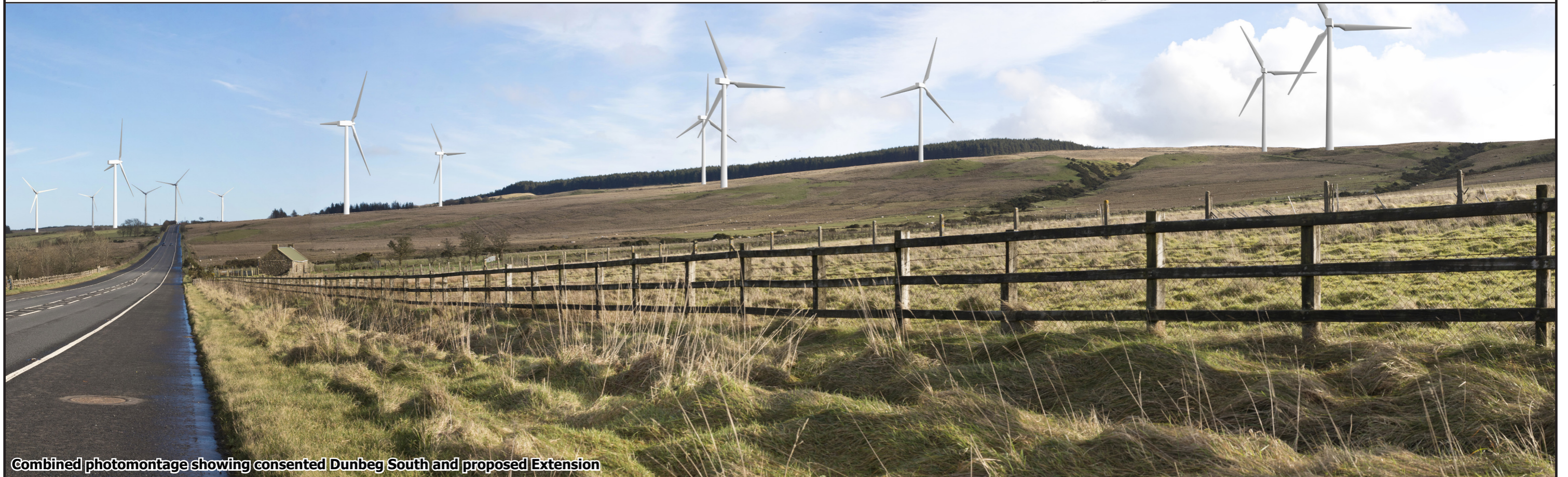
Combined photomontage showing consented Dunbeg South and proposed Extension

This material is based upon Ordnance Survey digital data © Crown Copyright 2024 and is reproduced with the permission of Land and Property Services under delegated authority from the Controller of Her Majesty's Stationery Office. All rights reserved. Licence No. 242.