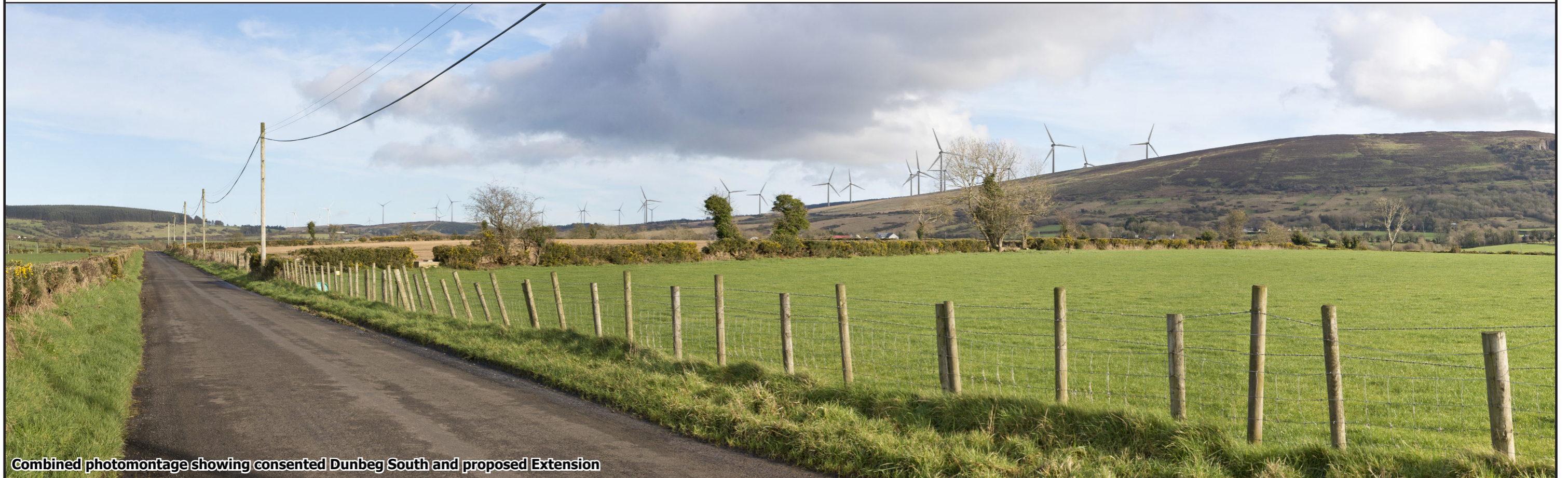
Combined photomontage showing consented Dunbeg South and proposed Extension

This material is based upon Ordnance Survey digital data © Crown Copyright 2024 and is reproduced with the permission of Land and Property Services under delegated authority from the Controller of Her Majesty's Stationery Office. All rights reserved. Licence No. 242.