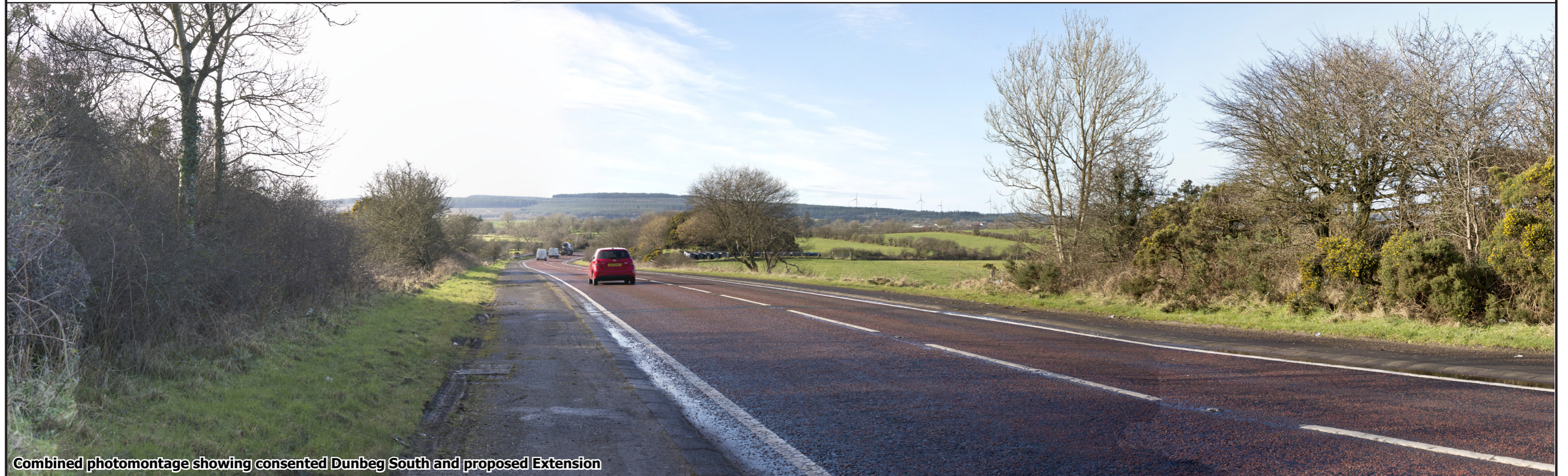
Combined photomontage showing consented Dunbeg South and proposed Extension

This material is based upon Ordnance Survey digital data © Crown Copyright 2024 and is reproduced with the permission of Land and Property Services under delegated authority from the Controller of Her Majesty's Stationery Office. All rights reserved. Licence No. 242.