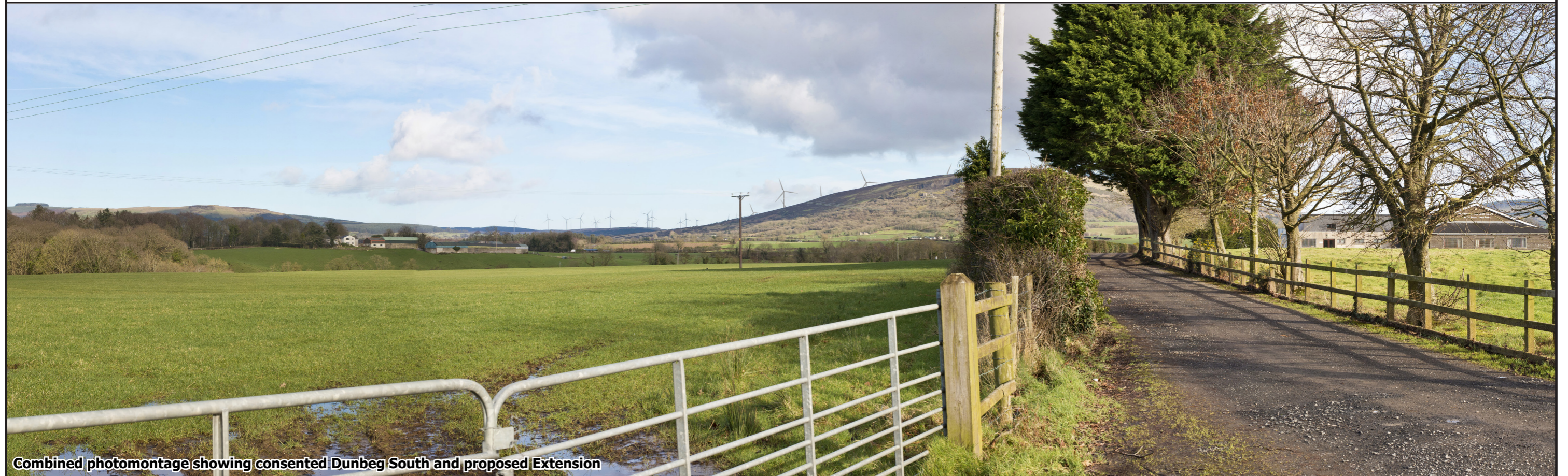
Combined photomontage showing consented Dunbeg South and proposed Extension

This material is based upon Ordnance Survey digital data © Crown Copyright 2024 and is reproduced with the permission of Land and Property Services under delegated authority from the Controller of Her Majesty's Stationery Office. All rights reserved. Licence No. 242.