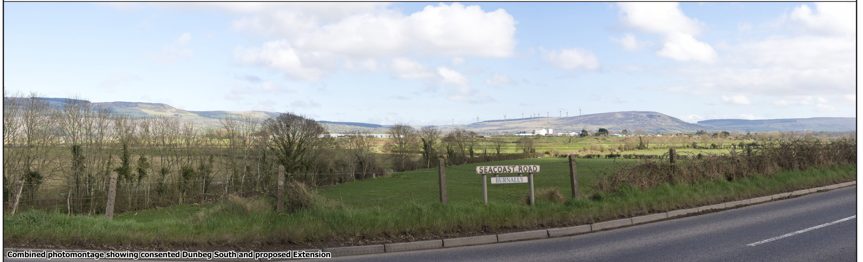
Combined photomontage showing consented Dunbeg South and proposed Extension