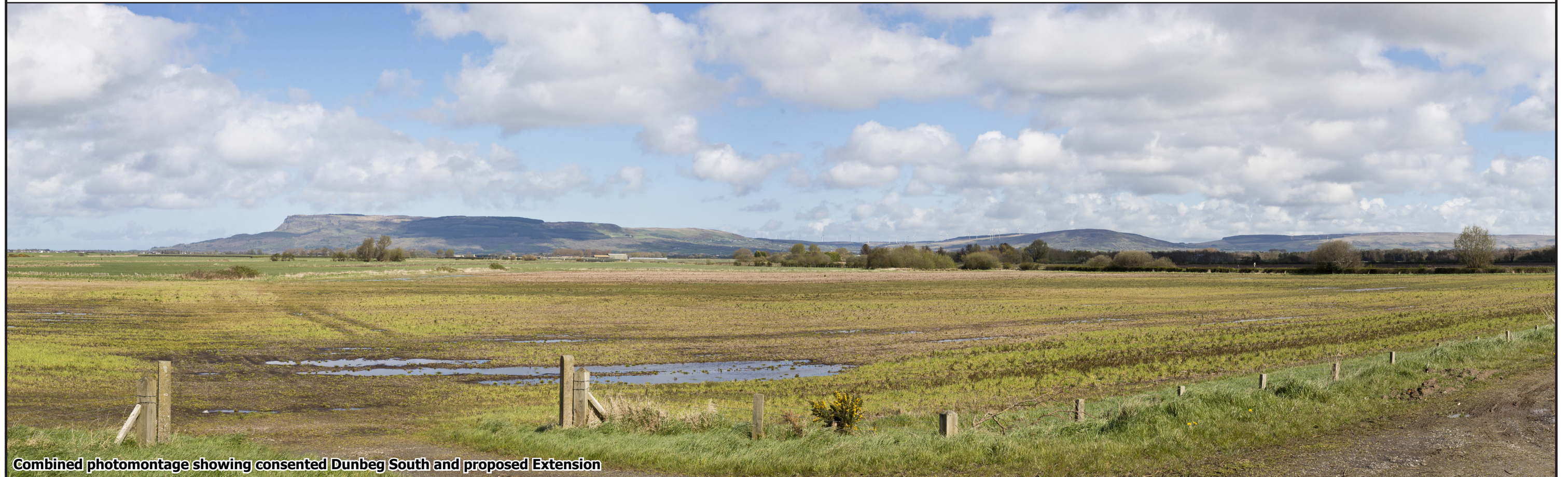
Combined photomontage showing consented Dunbeg South and proposed Extension

This material is based upon Ordnance Survey digital data © Crown Copyright 2024 and is reproduced with the permission of Land and Property Services under delegated authority from the Controller of Her Majesty's Stationery Office. All rights reserved. Licence No. 242.