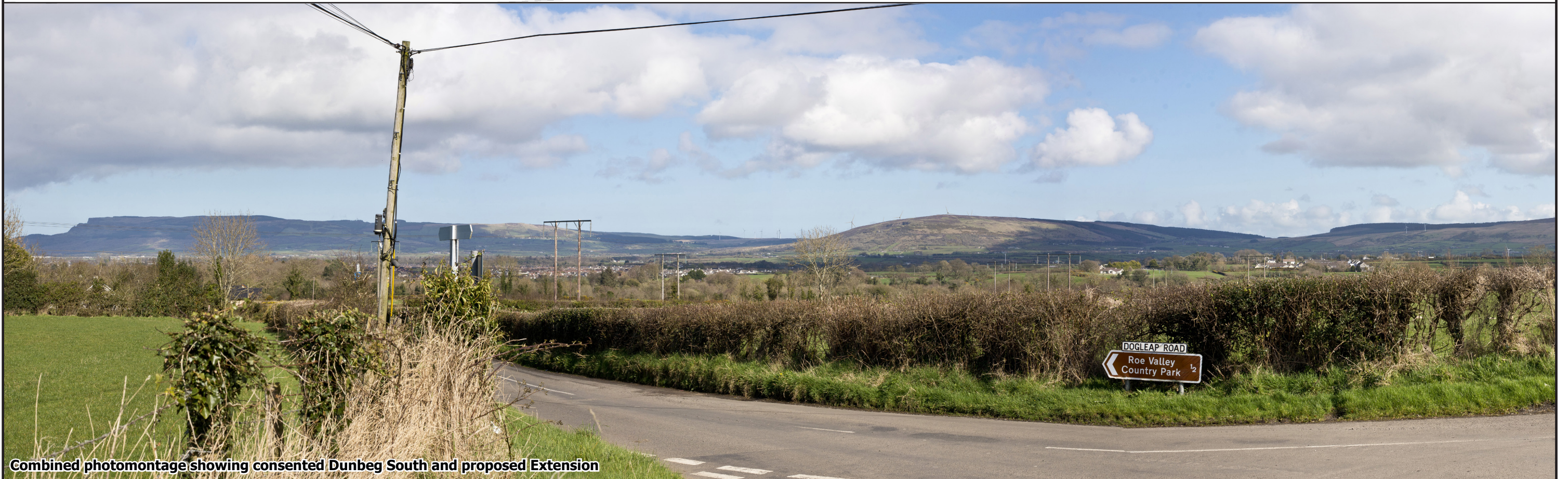
Combined photomontage showing consented Dunbeg South and proposed Extension

This material is based upon Ordnance Survey digital data © Crown Copyright 2024 and is reproduced with the permission of Land and Property Services under delegated authority from the Controller of Her Majesty's Stationery Office. All rights reserved. Licence No. 242.