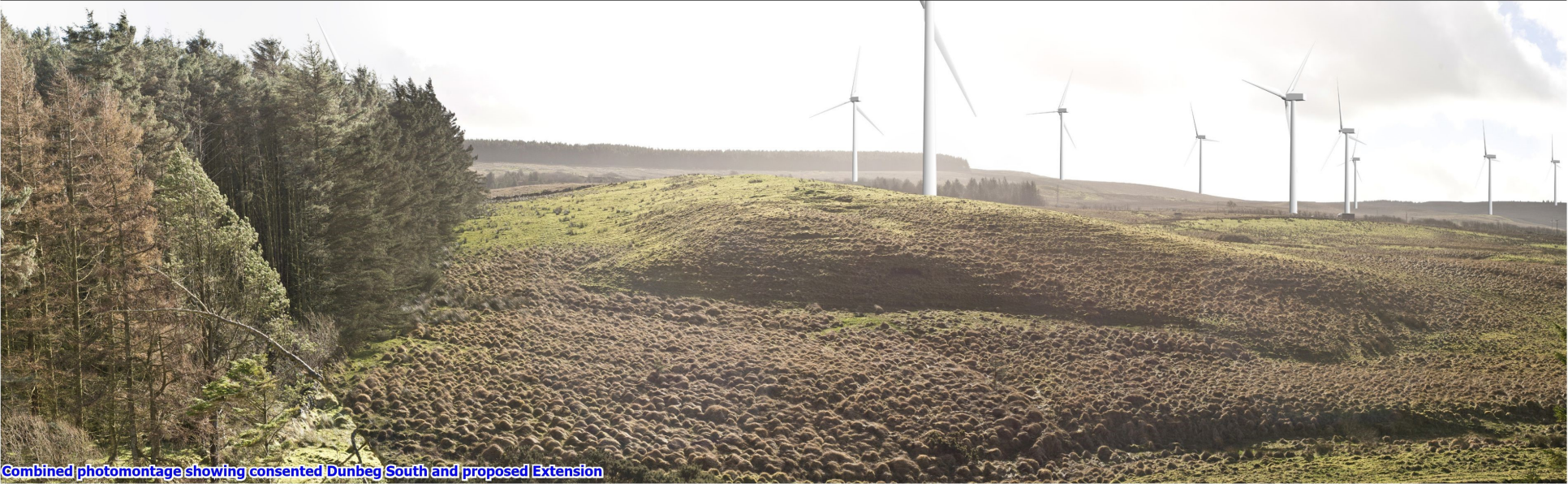
Combined photomontage showing consented Dunbeg South and proposed Extension

This material is based upon Ordnance Survey digital data © Crown Copyright 2024 and is reproduced with the permission of Land and Property Services under delegated authority from the Controller of Her Majesty's Stationery Office. All rights reserved. Licence No. 242.