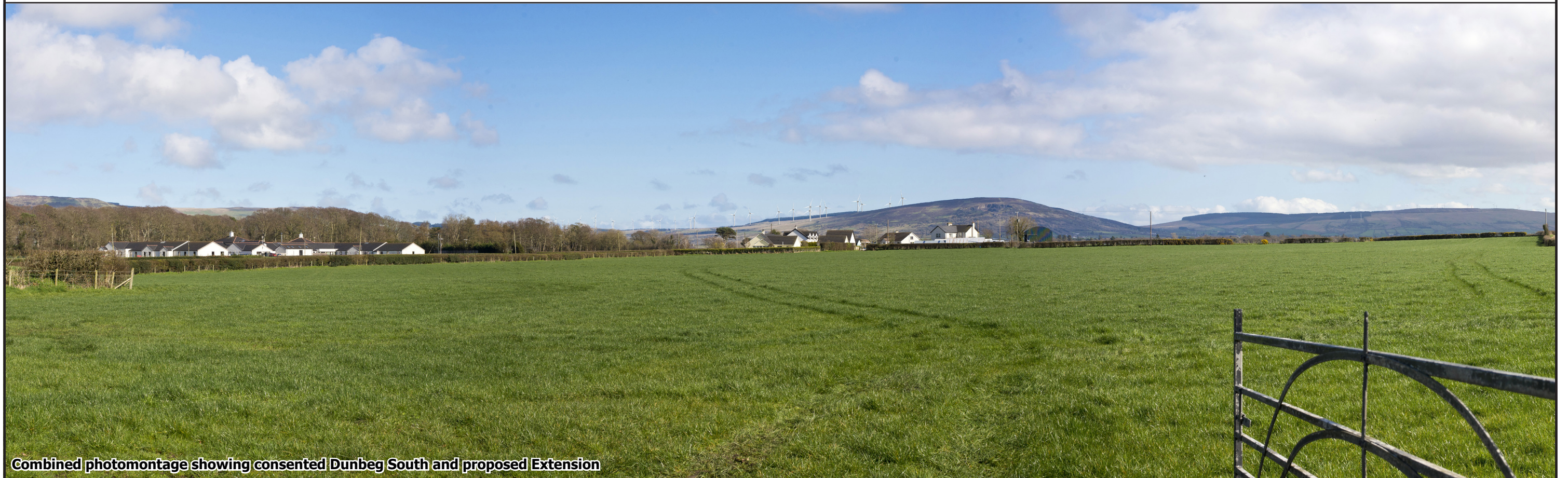
Combined photomontage showing consented Dunbeg South and proposed Extension

This material is based upon Ordnance Survey digital data © Crown Copyright 2024 and is reproduced with the permission of Land and Property Services under delegated authority from the Controller of Her Majesty's Stationery Office. All rights reserved. Licence No. 242.