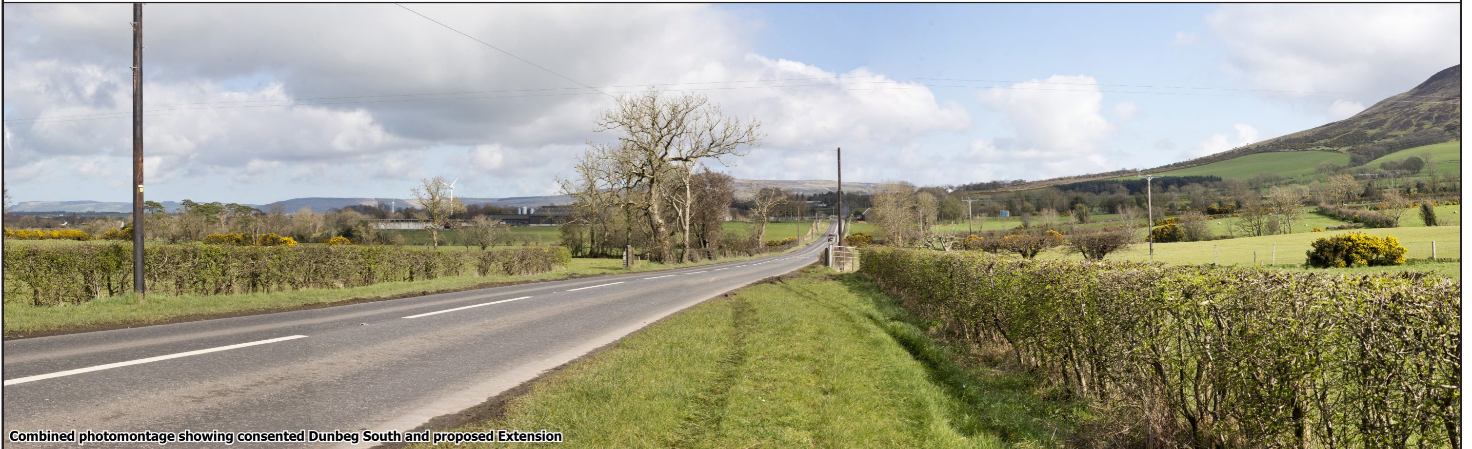
Combined photomontage showing consented Dunbeg South and proposed Extension

This material is based upon Ordnance Survey digital data © Crown Copyright 2024 and is reproduced with the permission of Land and Property Services under delegated authority from the Controller of Her Majesty's Stationery Office. All rights reserved. Licence No. 242.