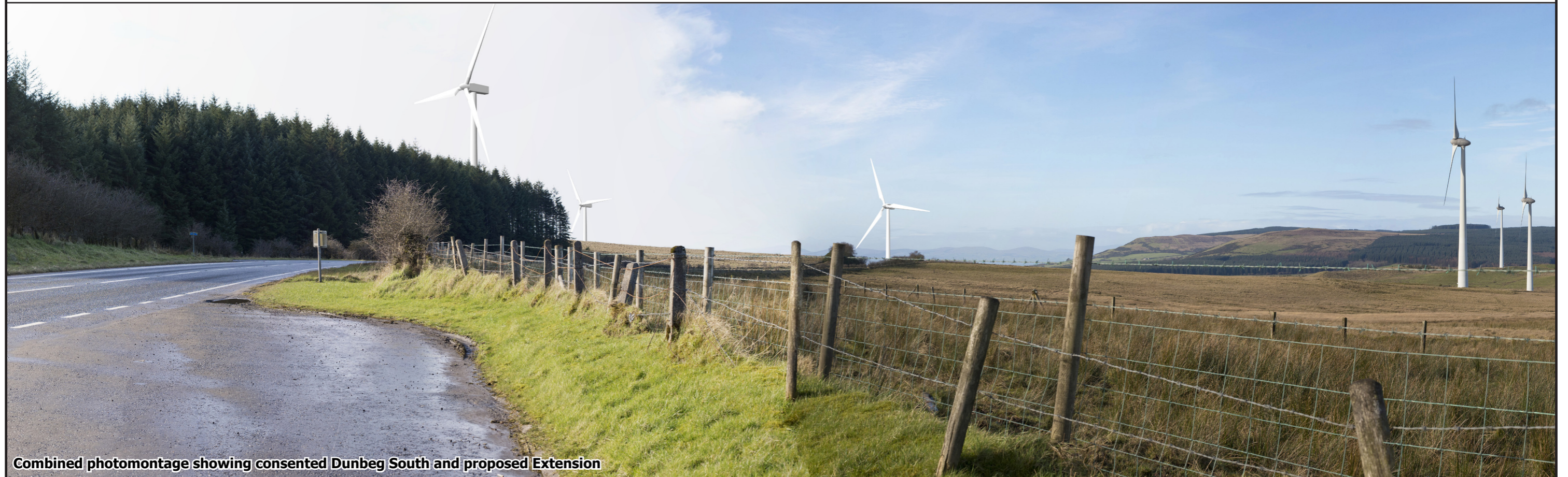
Combined photomontage showing consented Dunbeg South and proposed Extension