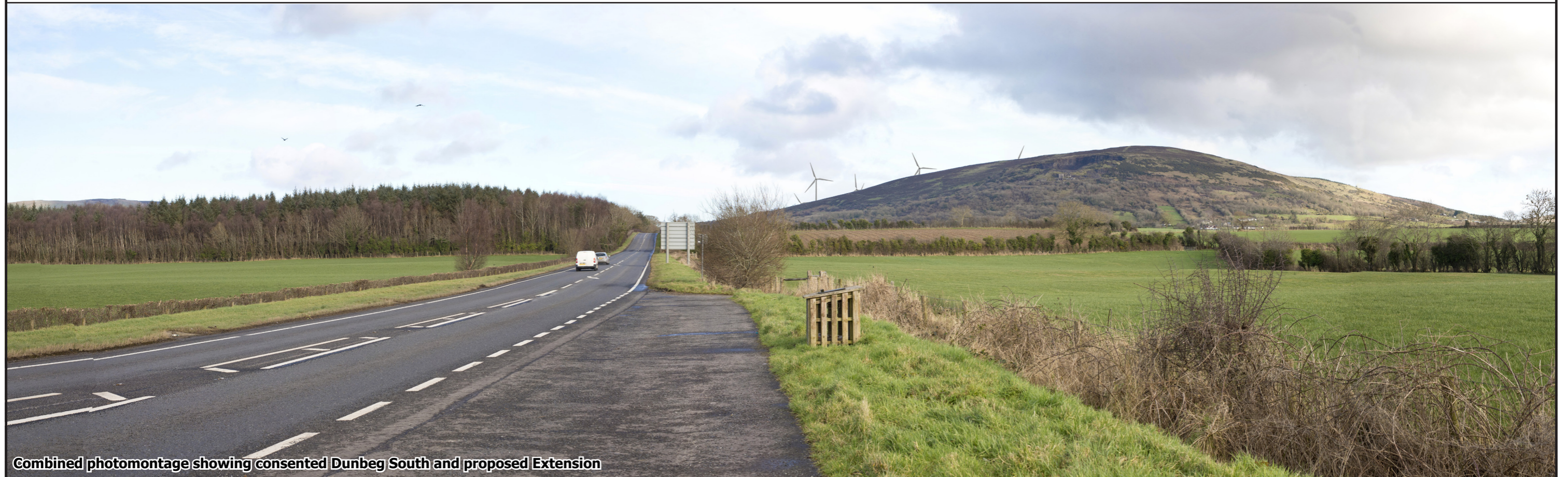
Combined photomontage showing consented Dunbeg South and proposed Extension

This material is based upon Ordnance Survey digital data © Crown Copyright 2024 and is reproduced with the permission of Land and Property Services under delegated authority from the Controller of Her Majesty's Stationery Office. All rights reserved. Licence No. 242.